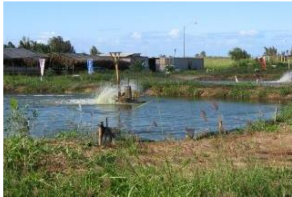
Shrimp farming in Waialua, Oahu

Community Based Economic Development (CBED) is a strategy for addressing the needs of low-income communities. CBED has been implemented in the United States for more than 40 years, and in Hawaii for 20 years. As the dialogue about incorporating community vision and values into present day Hawaii continues, CBED stands out as an effective strategy to achieve those goals by empowering the community, increasing capacity, and conserving local resources. CBED is a proven strategy that differs from traditional economic development because it emphasizes community reinvestment and economic opportunities. It is a complete process that addresses a community’s economic and social needs. CBED strategies help maintain Hawaii’s cherished quality of life for its residents over the long term, while community-based organizations (CBOs) provide social services and ecosystem services that make a locality attractive to new, appropriate investment and economic development. Due to the revenue shortfalls of the State, the CBED Program has focused on partnering with other State, Federal and private agencies to help build the capacity of community-based organizations through training workshops and other events.