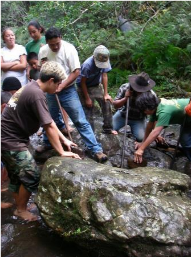
North Kohala Community members build a taro lo'i

The Hawaii Alliance for Community-Based Economic Development (HACBED) was established in 1989 by a group of community development practitioners. HACBED formulated strategies for the State government to support community-based organizations (CBOs) that wanted to create economic development initiatives. These efforts resulted in program legislation to provide financial and technical assistance to local groups. The Legislature created a CBED Program in the Department of Business, Economic Development & Tourism with Act 111, SLH 1991, codified as Chapter 210D, Hawaii Revised Statutes. The legislation created the CBED Advisory Council and the CBED Revolving Fund with an appropriation of $900,000 in 1991.