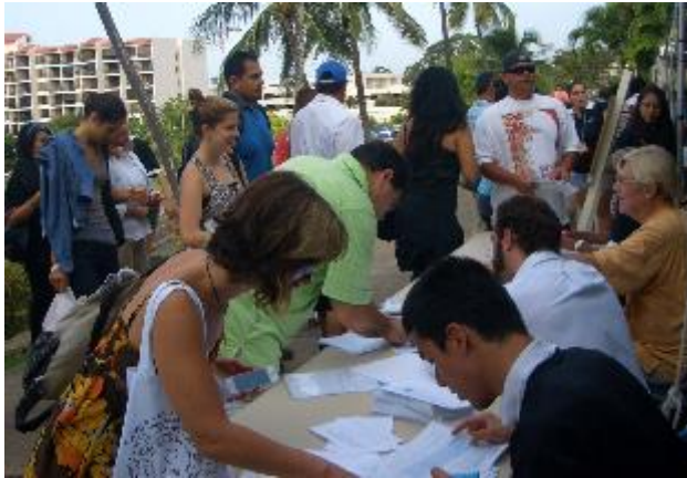
Attendees registering at Chaminade Small Business Fair

Tourism (DBEDT) co-hosted the Small Business Fair, “Launch Your Dreams into Reality.” More than 200 small business owners and entrepreneurs attended the free one-day event featuring 23 business-related workshops and one-on-one business counseling, plus exhibits with vendors from Federal, State and local agencies, organizations and financial institutions.