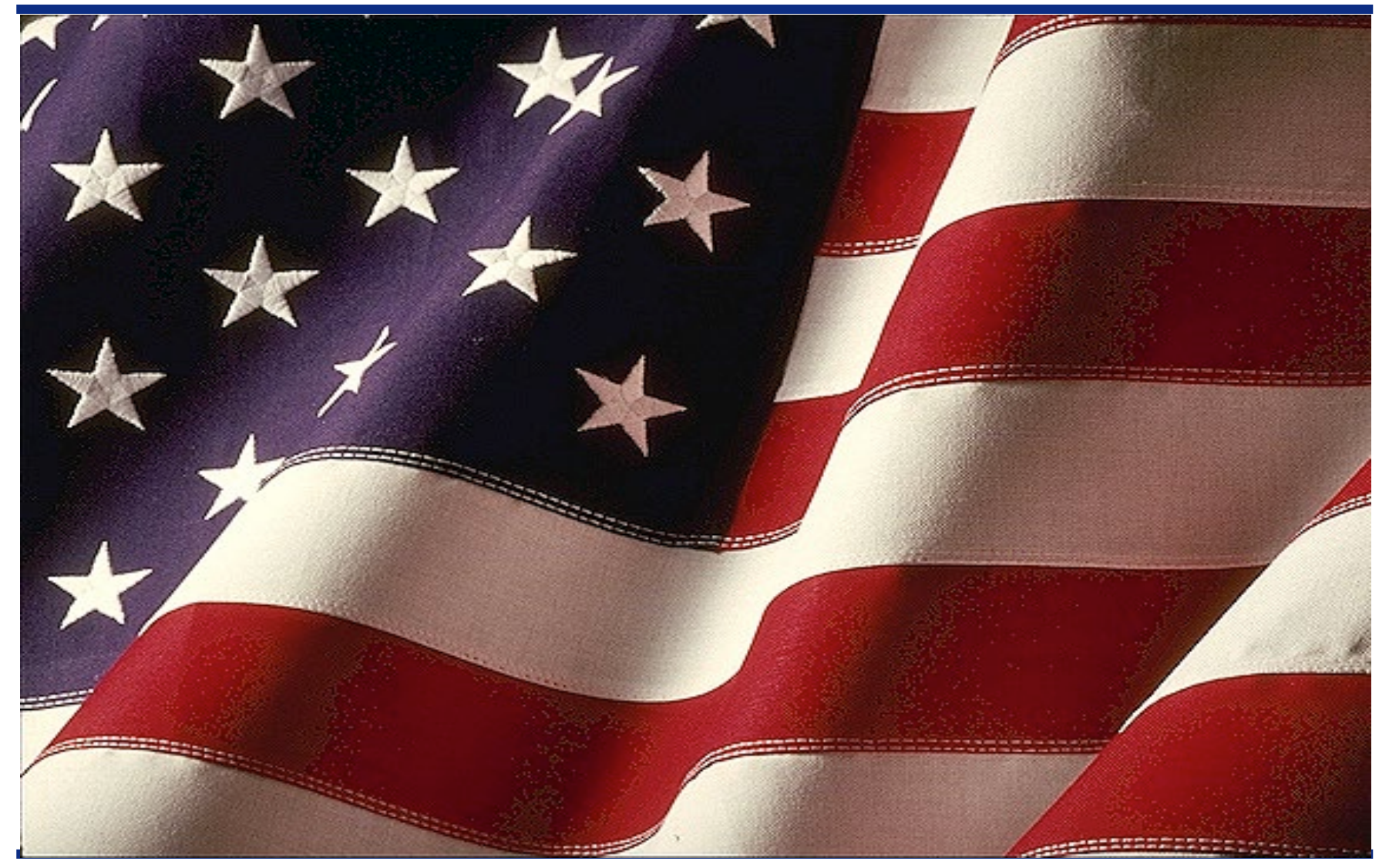
Integrity - Service - Excellence