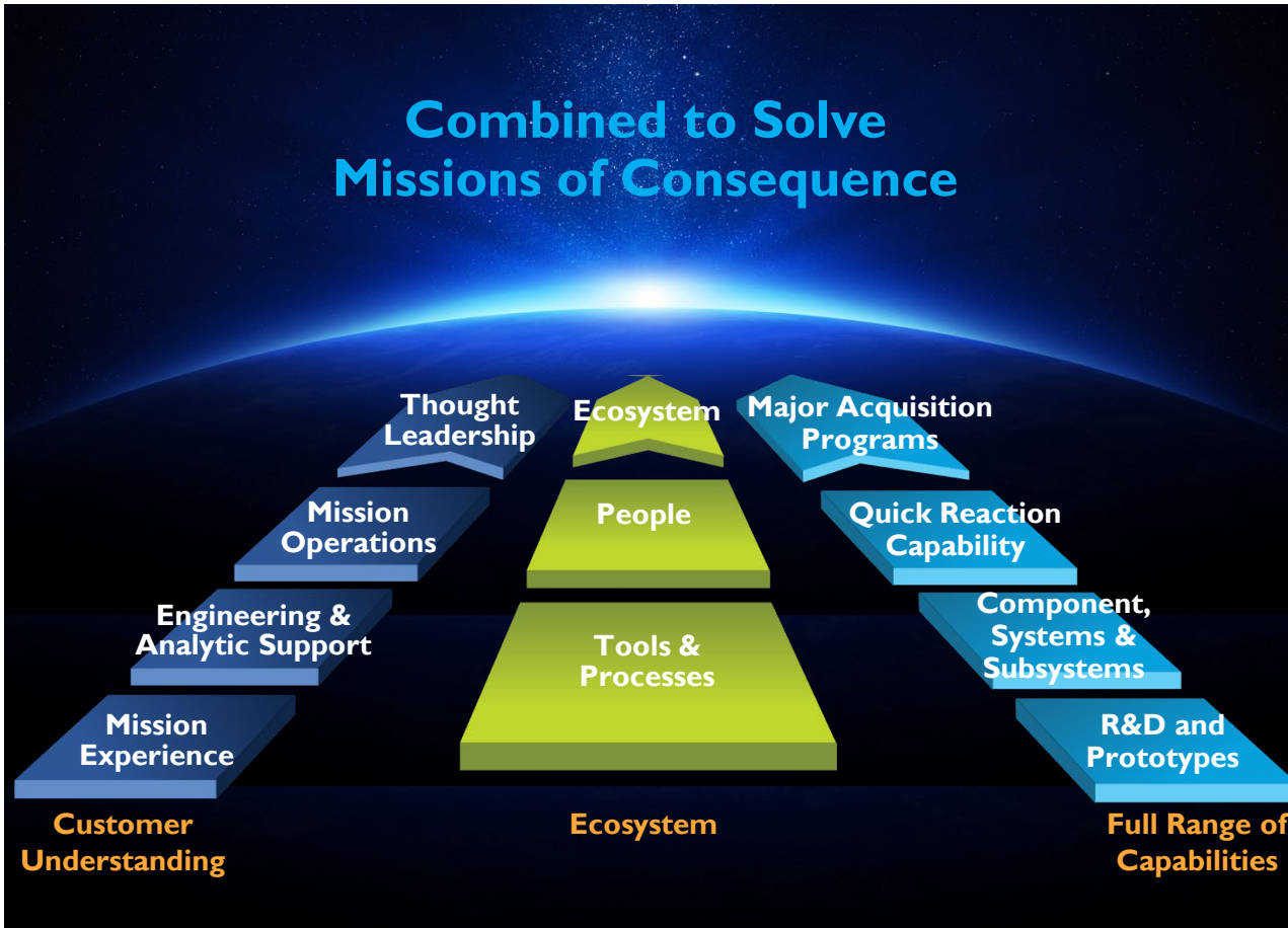
Elements of a Mission Capability Integrator