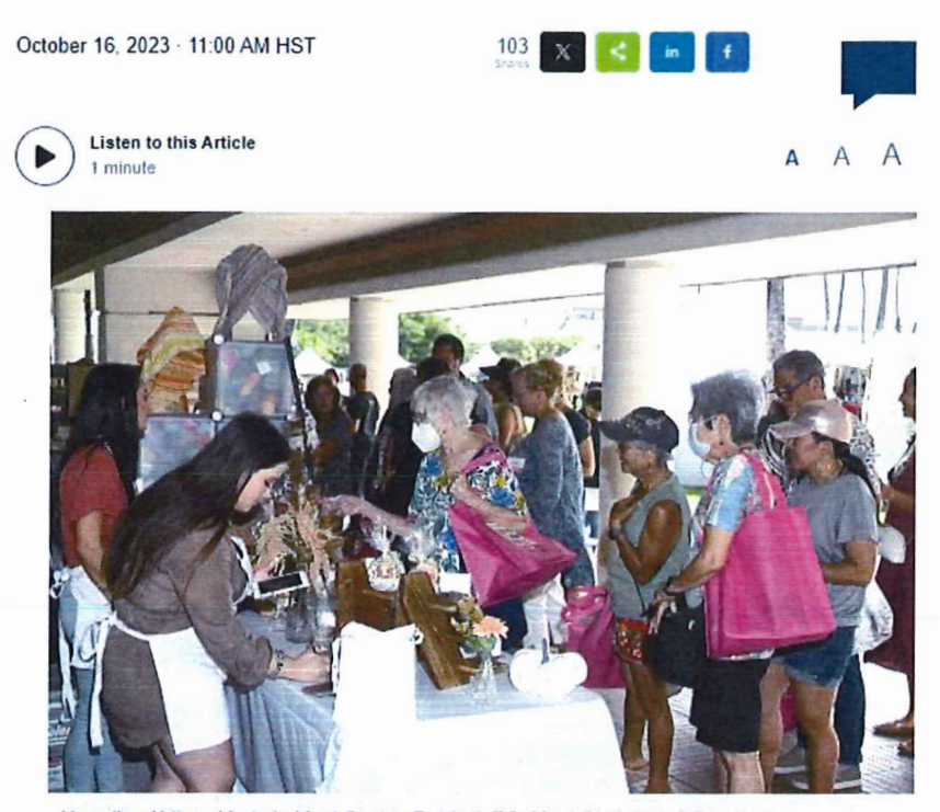
Hawaiian Airlines Made in Maui County Festival.

Maui small businesses hit by this summer's wildfires are getting financial support to participate in this year's Hawaiian Airlines Made in Maui County Festival, happening on Nov. 3 and 4, 2023 at the Maui Arts & Cultural Center.