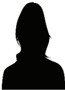
VACANT, CBED Advisory Council Member (Maui)