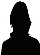
VACANT, CBED Advisory Council Member (Kauai)