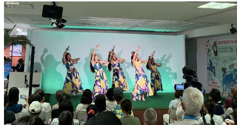
Hula on stage