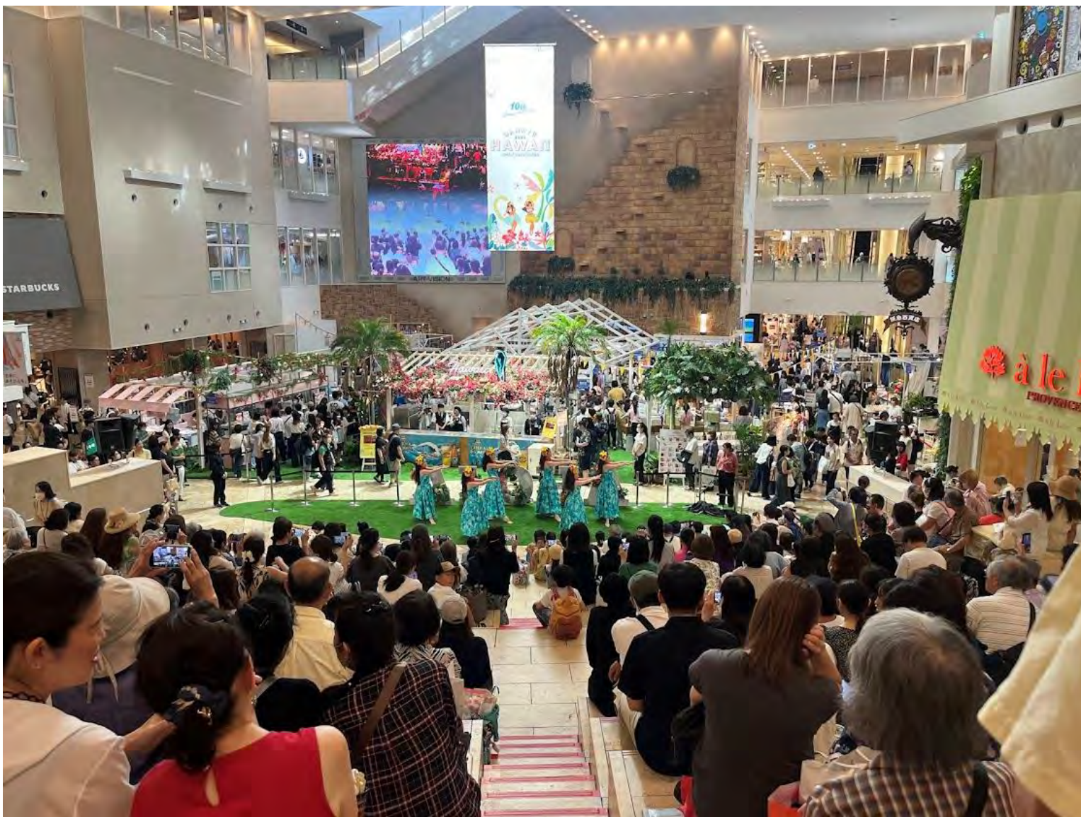
Main event hall