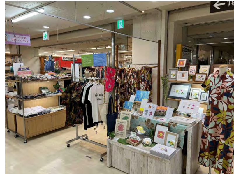
Products only available in Hawaii