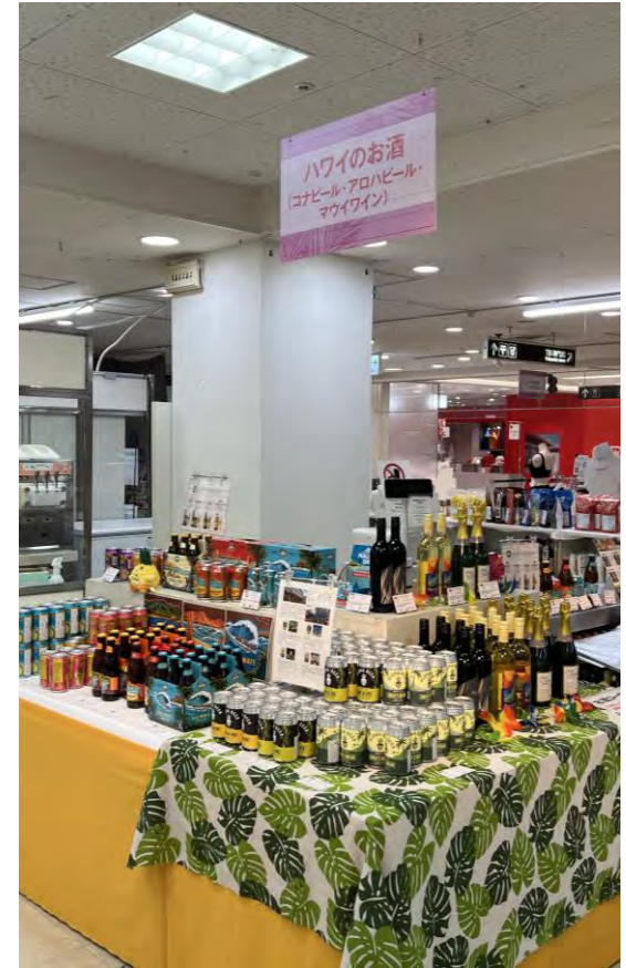
Food & Beverage