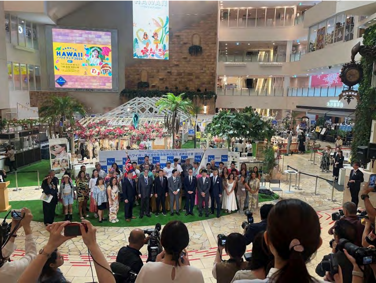
Partnership with DBEDT