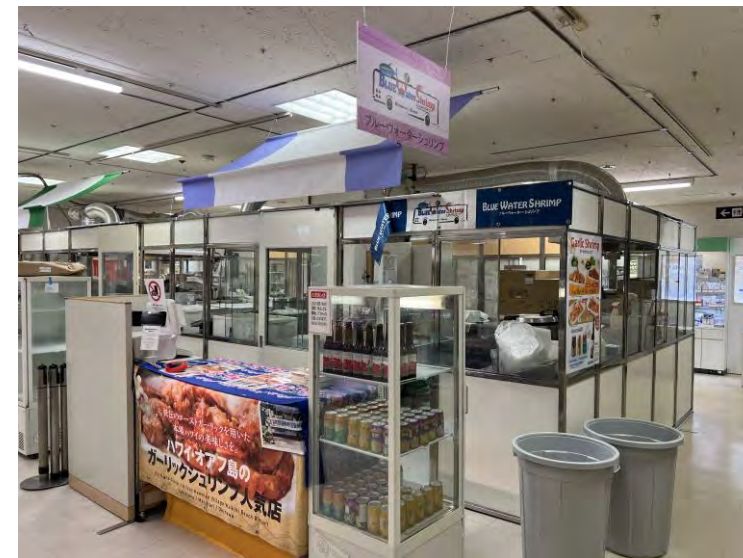
Local plate lunch