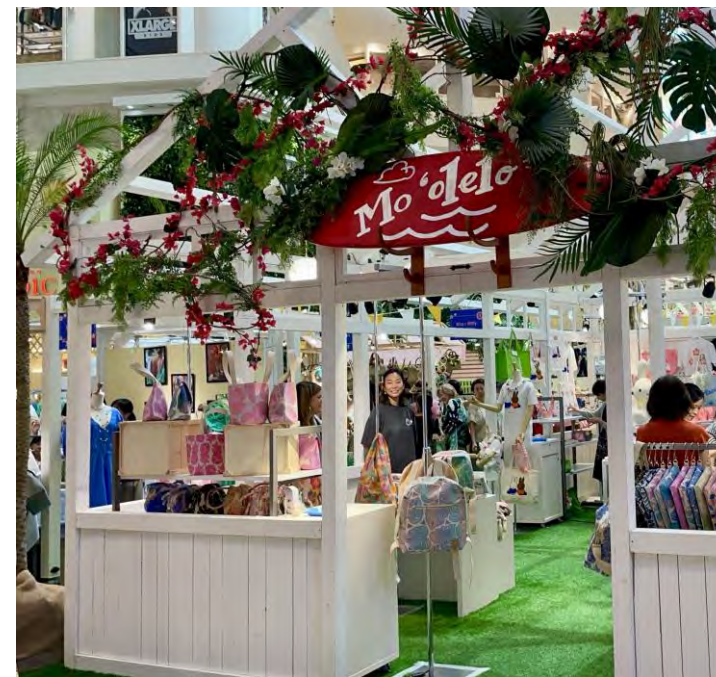
Booths at event hall