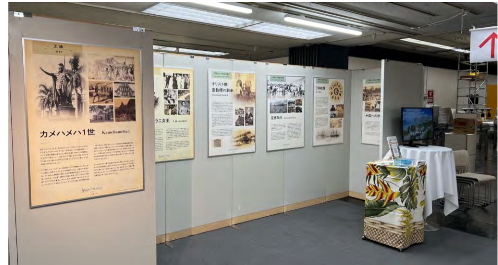
Installation of history of Hawaii