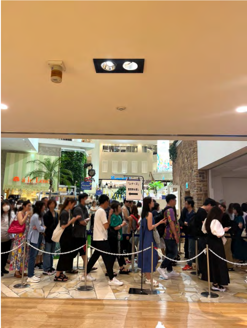
Waiting line for malasadas