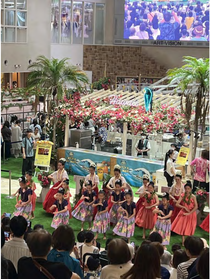
Keiki hula performance