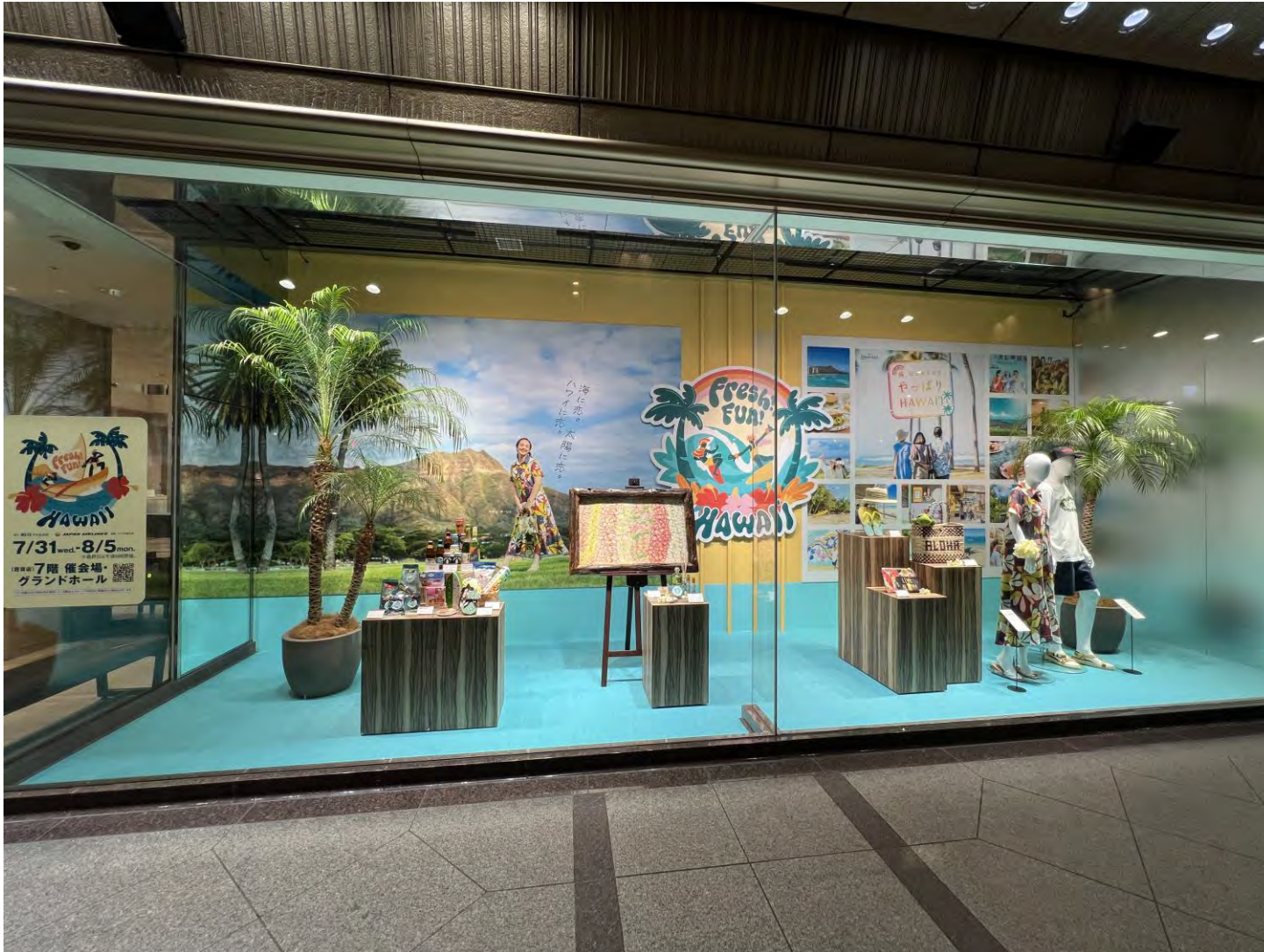
Store front window display