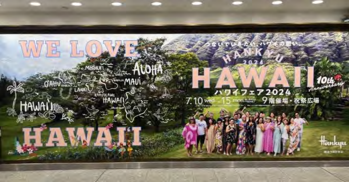
Big advertisement at Umeda Station