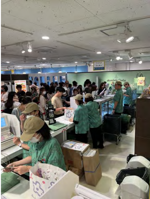
Event space(Food area)