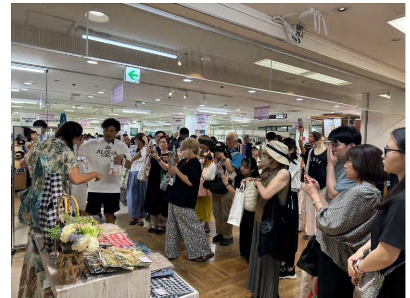
Meet & Greet event