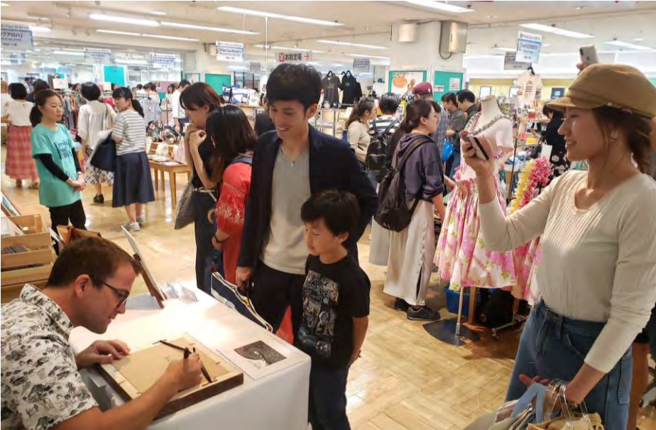
Autographed by artist