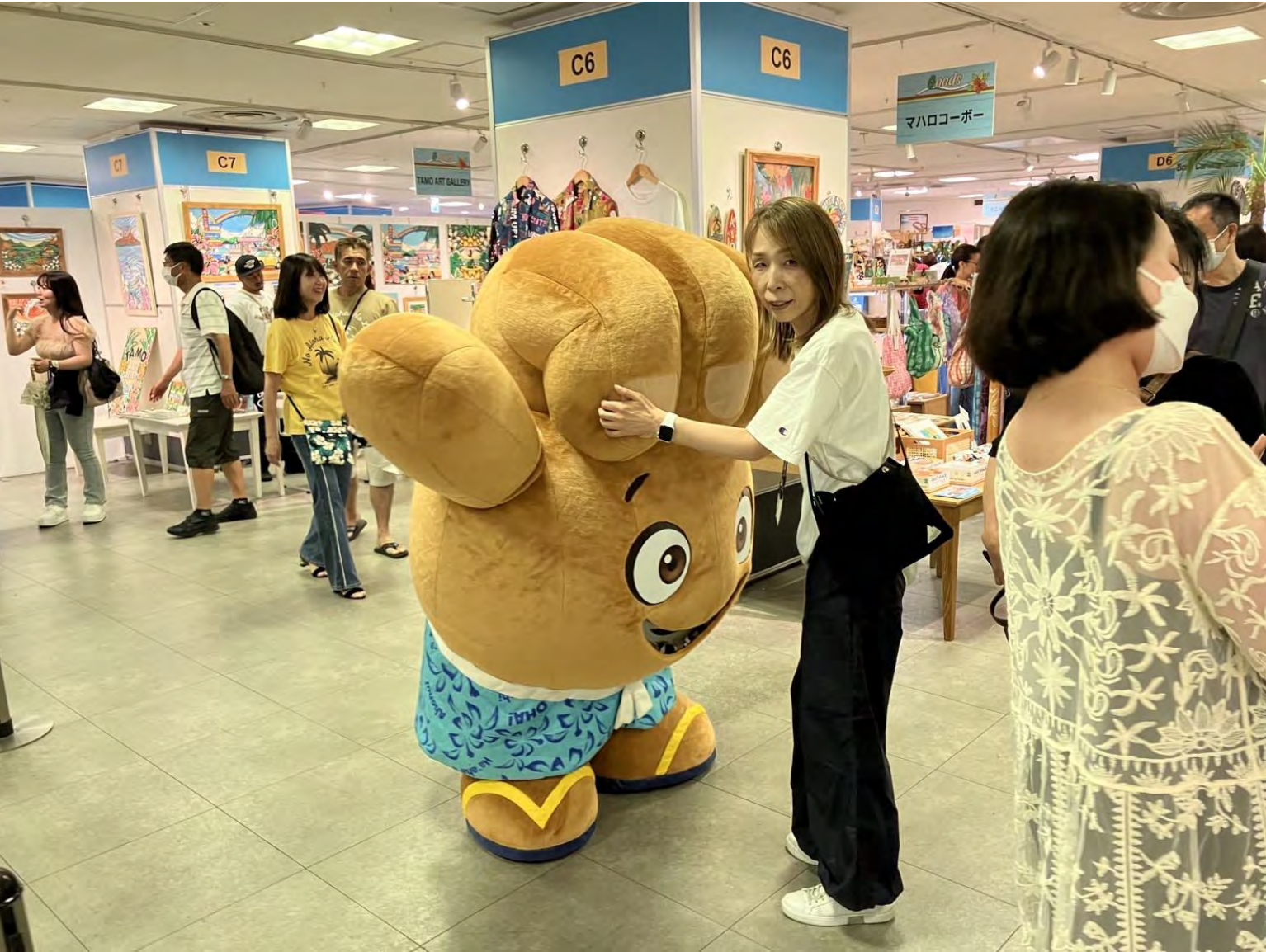
Meet with Hawaii Toursim Japan's Mascot