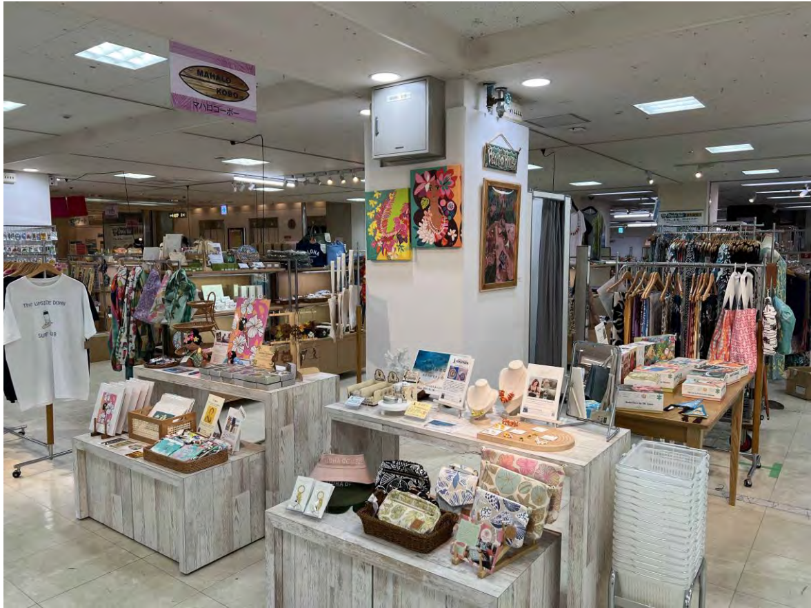
Handmade & Craftmanship