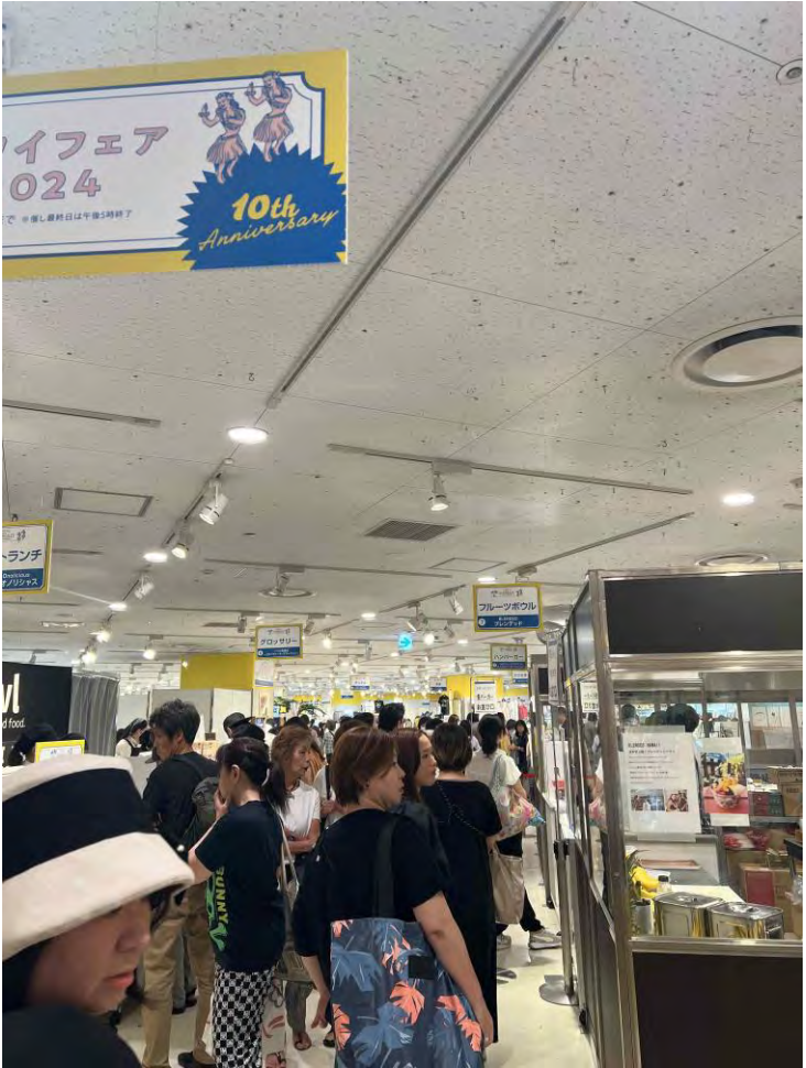
Food area at Event Space