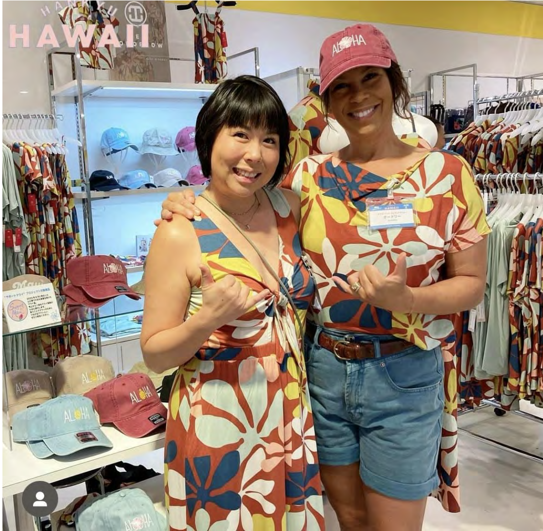
Apparel and accessories