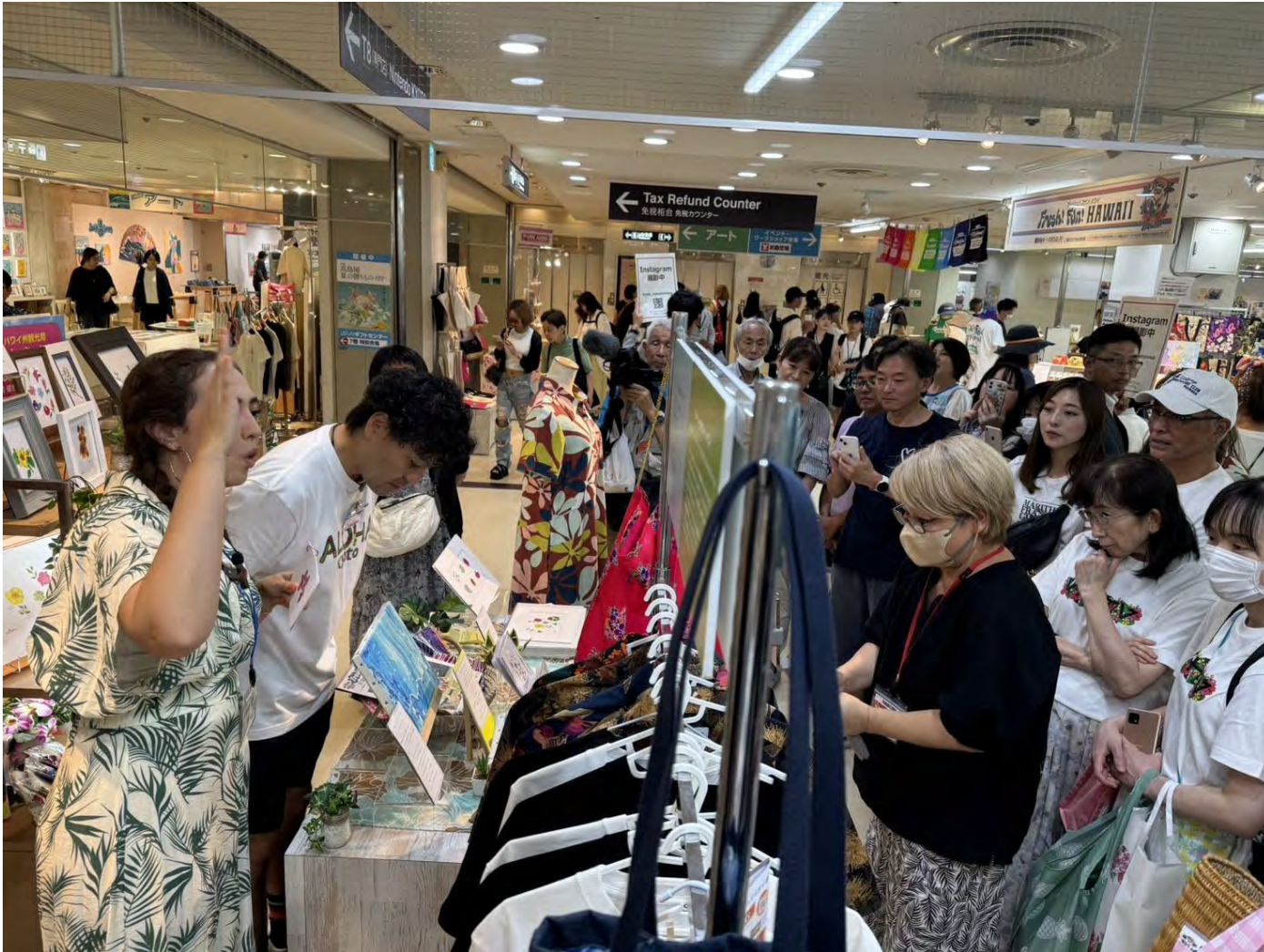
Meet & greet event