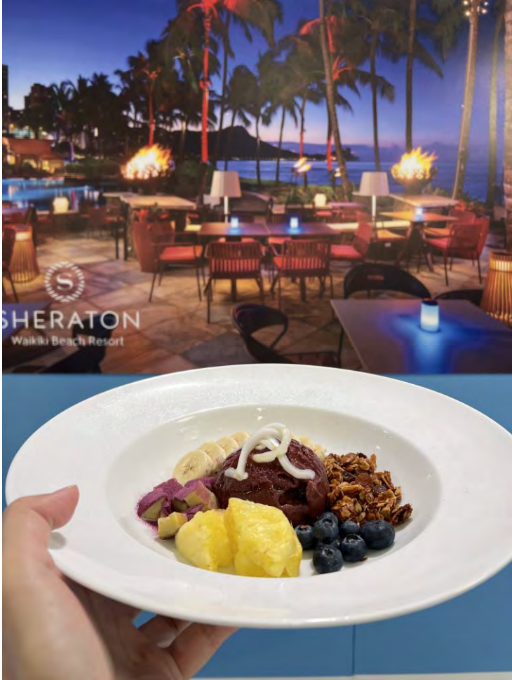
Eat in area