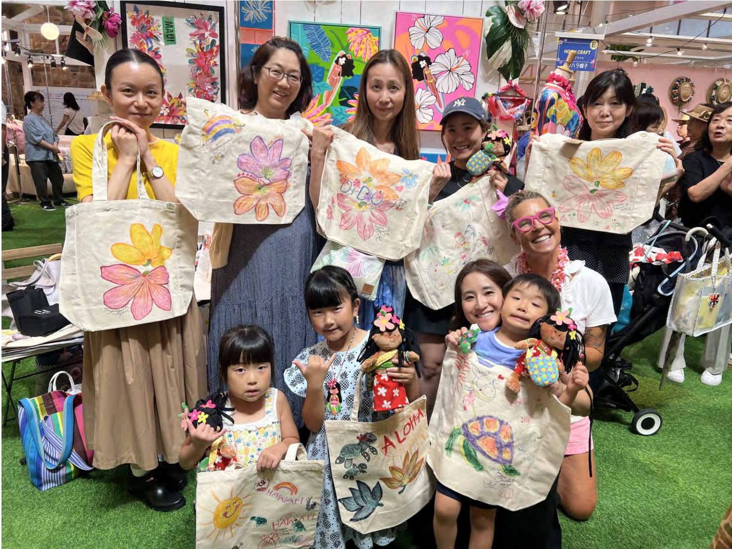
Workshop with artist from Hawaii