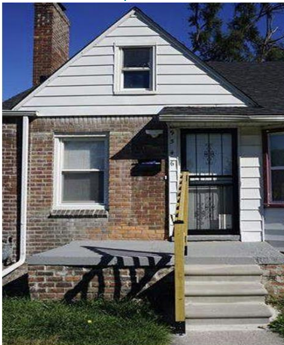
Circuit Avenue: Detroit, MI Single Family Homes

Impact: Affordable housing with a path to home ownership