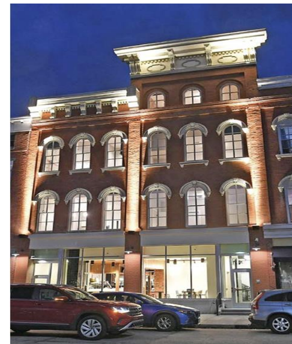
Erie Flagship: Erie, PA Downtown Revitalization

Impact: Revitalizing downtown, job creation, affordable/market housing