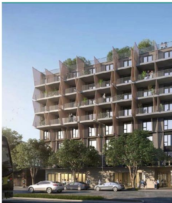
1411 Flower Street: Los Angeles, CA Affordable Housing

Impact: Affordable housing supporting formerly homeless individuals